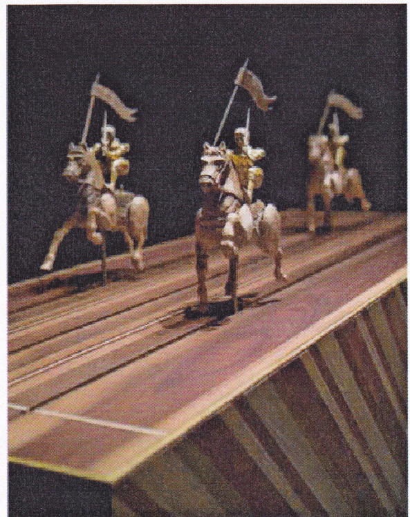
Top: Anna Nazzari, Casino Sisyphus (installation view), 2010.