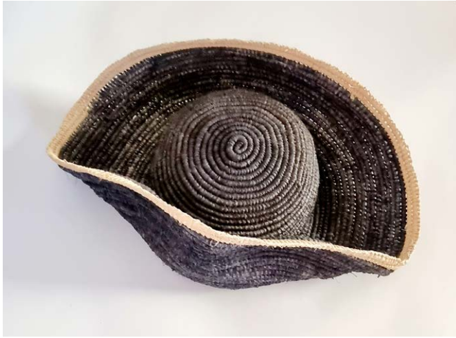
Lea Taylor, Yigan-tjoo- Do Not Disturb , 2022, courtesy and copyright of the artist