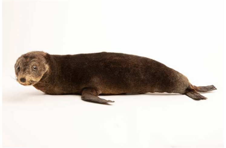
Seal Skin